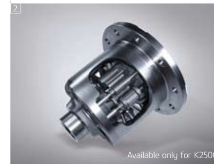
Available only for K2500