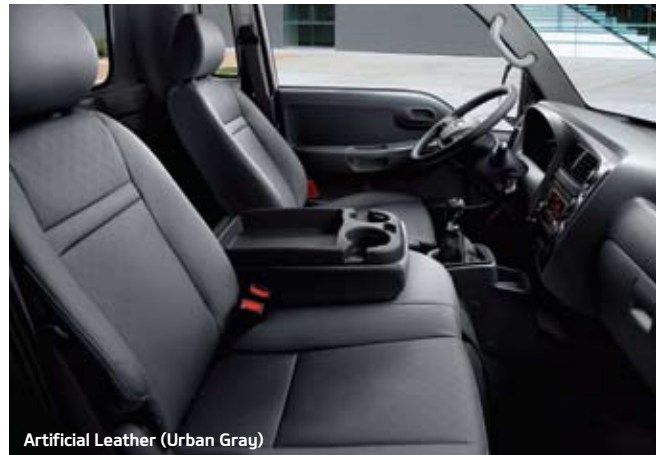
Artificial Leather (Urban Gray)