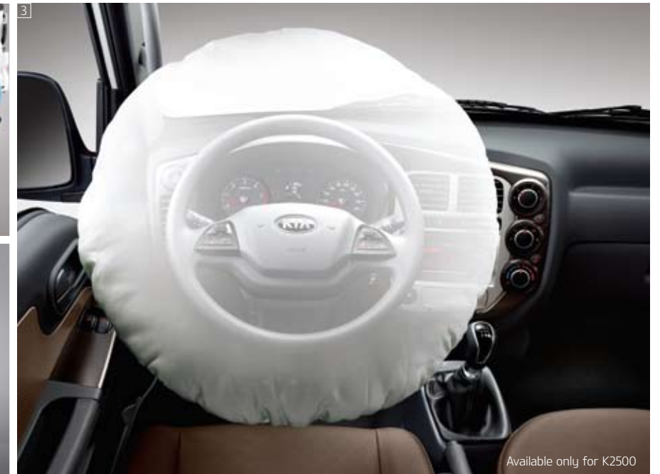
Available only for K2500