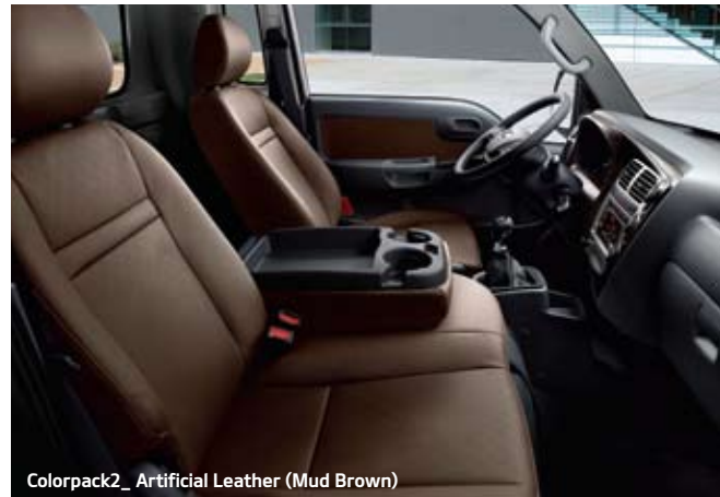
Colorpack2_ Artificial Leather (Mud Brown)

All information contained herein was based upon the latest available information at the time of printing. Descriptions are believed to be correct, and Kia Motors Corporation makes every effort to ensure accuracy, however accuracy cannot be guaranteed. From time to time, Kia Motors Corporation may need to update or make changes to the vehicle features and other vehicle information reported in this brochure. Some vehicles shown include optional equipment that may not be available in some regions. All video and camera screens shown are simulated. Kia Motors Corporation, by the publication and dissemination of this material, does not create any warranties, either express or implied, to any Kia products. Contact your local Kia dealer for the most current information.